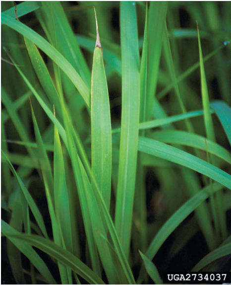
Figure 1. Cogongrass plants are yellow to green in color. Note that the edges of the leaf tend to have more yellow than green.

green in color (Figure 1). Individual leaf blades are flat and serrated, with an off-center prominent white midrib (Figure 2). The leaves reach 2–6 feet in height. The seed head (Figure 3) is fluffy, white, and plume-like. Flowering typically occurs in spring or after disturbance of the sward (mowing, etc.). Seed heads range from 2 to 8 inches in length and can contain up to 3,000 seeds. Each seed contains silky-white hairs that aid in wind dispersal. When dug, the rhizomes (Figure 4) are white, segmented (have nodes), and are highly branched. The ends of the rhizome are sharp pointed and can pierce the roots of other plants.