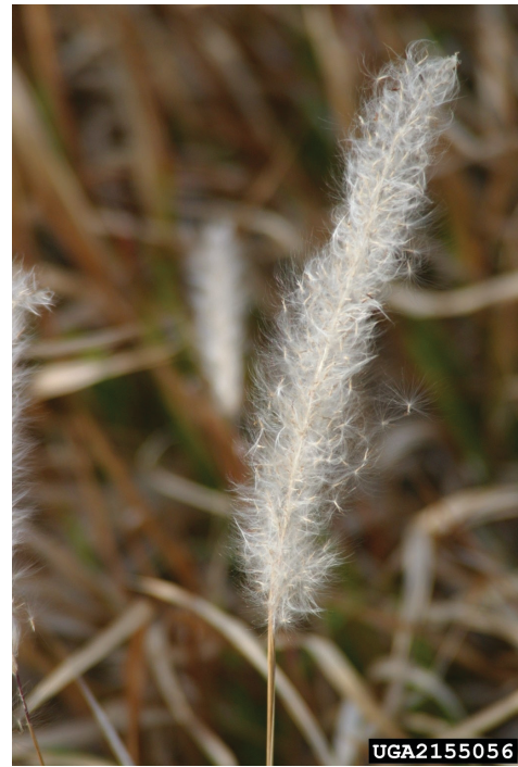
Figure 3. Cogongrass seed heads are fluffy and white. Each plant produces nearly 3,000 seeds.