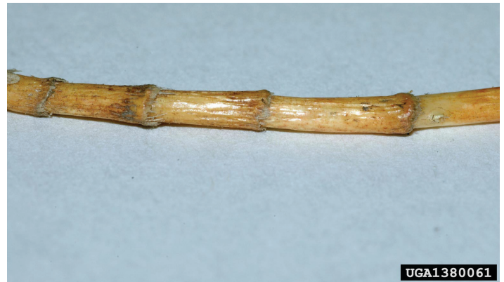
Figure 4. Cogongrass rhizomes are segmented (have nodes) where new shoots are able to grow.